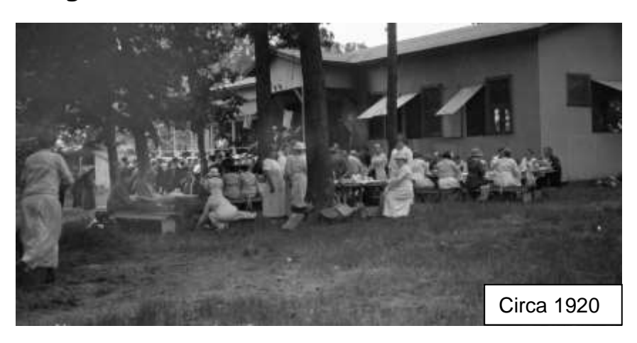
1903 Original Construction

In 1918 Table board in the spacious Dining Hall costs $5 per week or $1 per day.